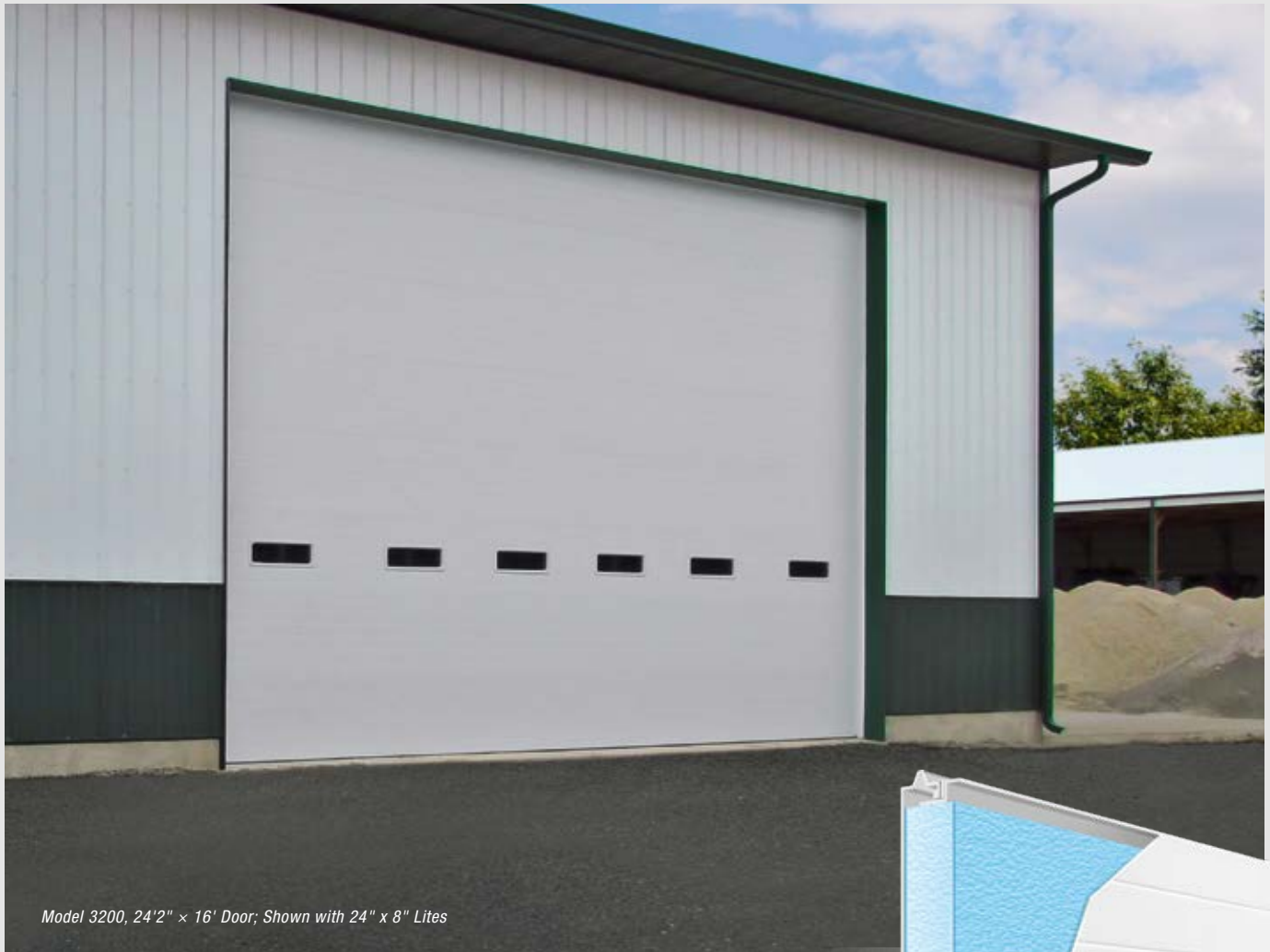
Model 3200, 24'2" x 16' Door; Shown with 24" x 8" Lites