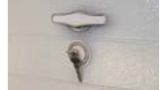
Outside keyed lock